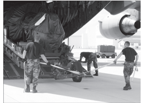
Five Air Guard units took over aerial port operations at Charleston Air Force Base, S.C., July 21-Aug. 3 for the first all-Guard Patriot Partner exercise.

Both active-duty and Guard personnel re-